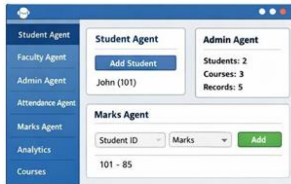
Fig. 3. Software Implementation Workflow.